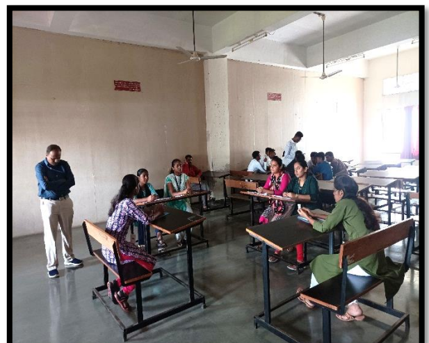
Figure 5.6.3: GD Session