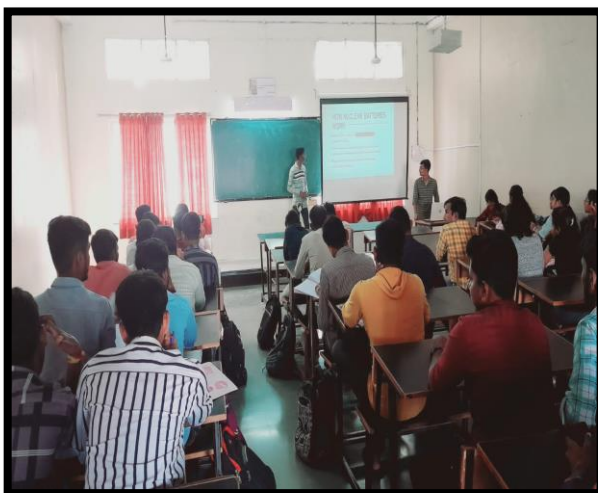
Figure 5.6.2: LCD Session