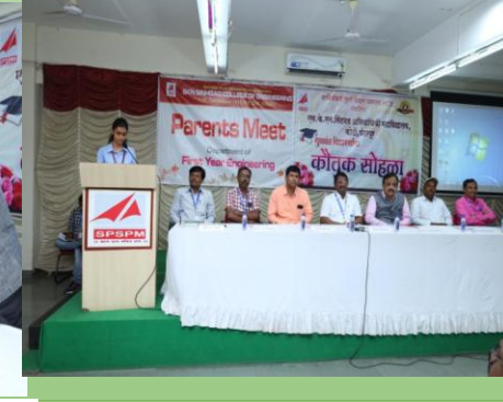
83 Students Achieved 10/10 SGPA in SEM-I University Examination