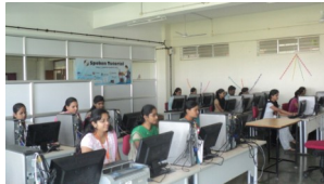
TE (CSE) student solving moodle test

For this semester distributing notes and conducting online MCQ's for each subject department uses moodle server(E-Learning Tool). Moodle is the open source tool run on almost all platform, supporting a lot of useful function and customization. Also, it's available in 78 languages! It is used all over the world by teachers and educators and it's probably the best E-Learning tool in the net!